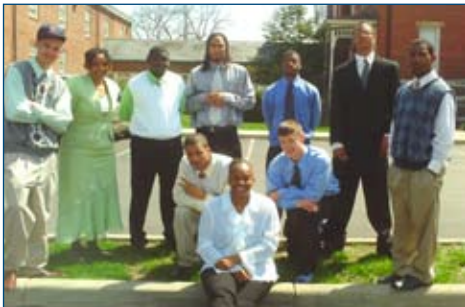
Clients and staff on their way to meet Bill Cosby

Bill Cosby, comedian, author, actor and philanthropist, hosted clients in Alvis House's Young Adult Reentry Program for an intimate, invitation-only audience with him in Columbus. Youth listened to Cosby as he shared stories about his experience of moving from poverty to prosperity and he challenged them to "dare to dream outside their box and comfort zone and to pursue a college education."